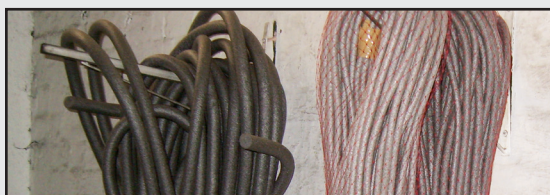
AVAILABLE IN VARIOUS WIDTHS