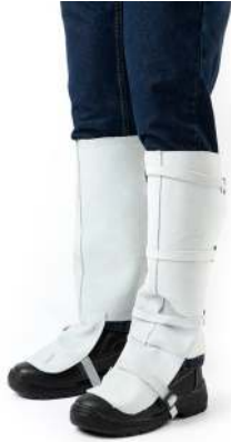
DH SPAT KNEE