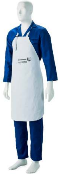
ACE ONE 60X90