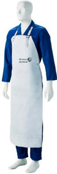
ACE ONE 60X120