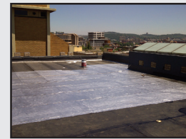
BITUMEN & GALVANISED SURFACES